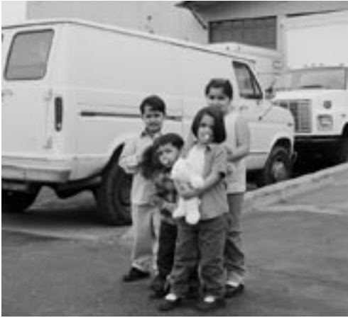
Your generosity helps those in need.

Did you know that the money you give to a parish's St. Vincent de Paul Conference goes to directly help the neighbors in your community?